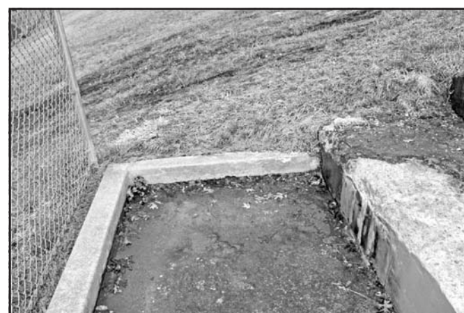
Groundwater has made the TCHS baseball field unplayable and has worked its way down to the concrete bleachers in Frank McClure Memorial Stadium.

something that is in need here desperately."